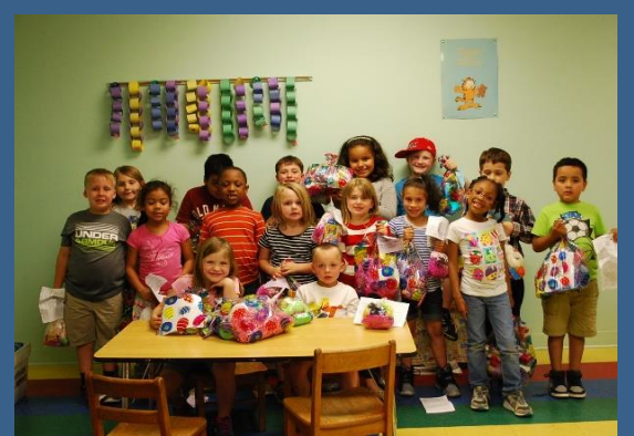
Children at Henry Fork

There are only two paid employees. None the less, they provide a pre-school program, serve 55 – 65 students daily in their after school program, and serve 70 students over the summer with a recreation, math, and science program. Needless to say, they can only accomplish this with the help of a host of volunteers. SML CHT funds will be used to update the fleet of vehicles for transporting students from school, to home, and to and from educational and recreational activities and service projects. They hope to purchase a 15 passenger raised roof bus to safely transport the elementary and Middle School students. The Henry Fork Service Center is a place filled with joy and sweet children.