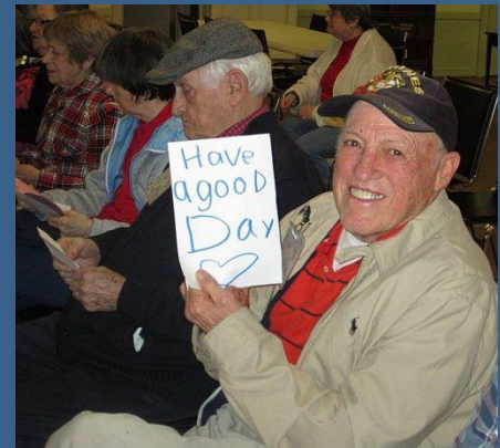
All smiles at the Adult Care Center of Central Virginia